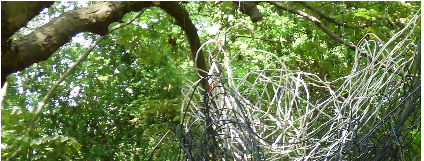
Cloud (external), Cadi Froehlich